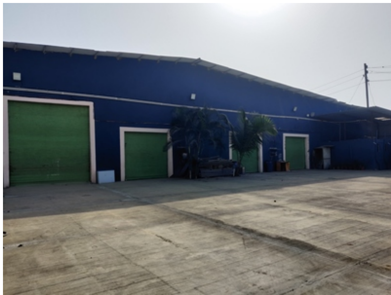
UNITS WITH OPEN RCC LAND