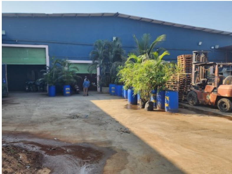
BEAUTIFUL GREENERY ENTERENCE