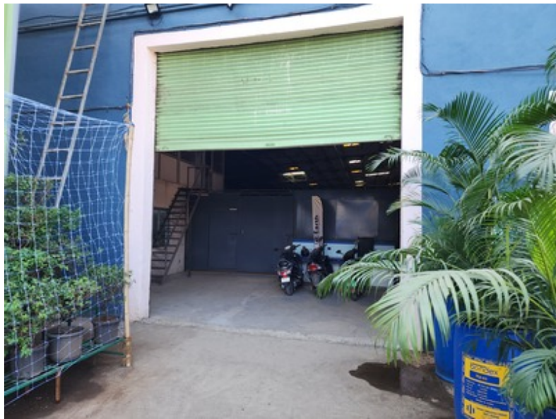
THREE SHUTTERS FULL SIZE