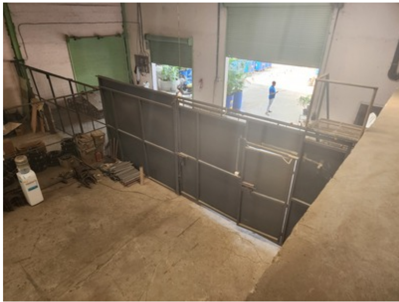
EXTRA LAYER OF PROTECTION