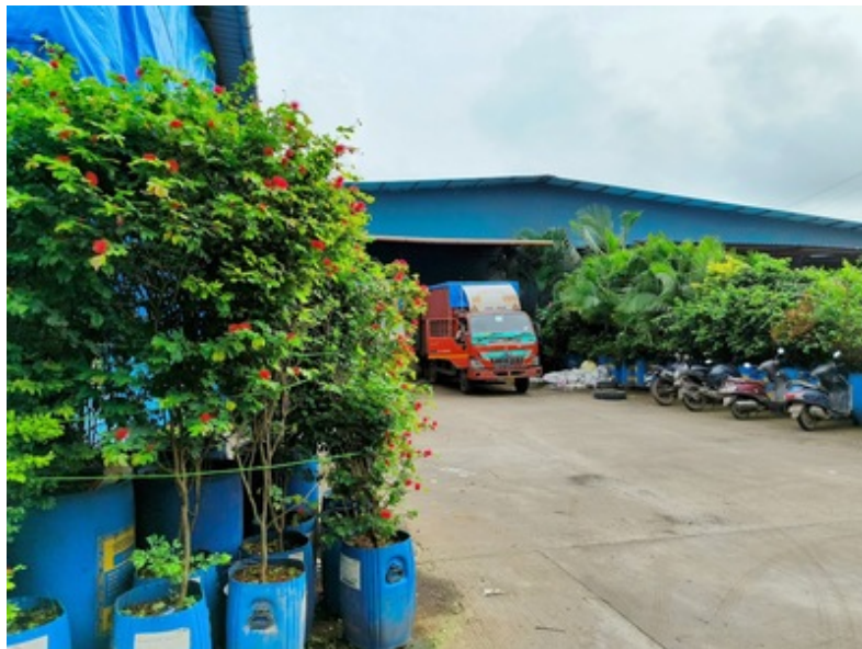
Private Open Space