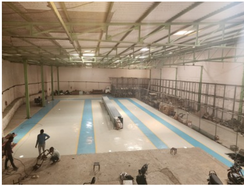
VIEW FROM UPPER CABINS