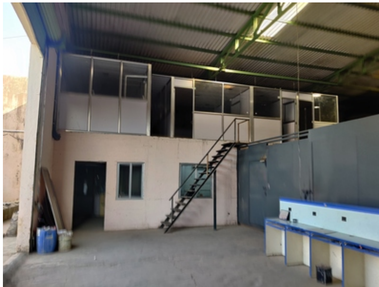
LEFT HAND SIDE VIEW WHILE ENTERING