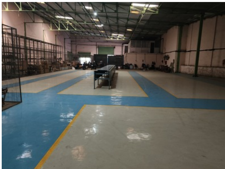
EPOXY FLOORING NEWLY DONE