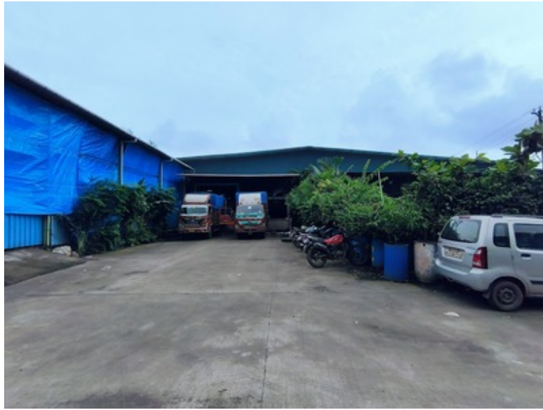
View of Main Entry

Email: info@kunarkrealestate.com , info@jkgears.com website: www.kunarkrealestates.com