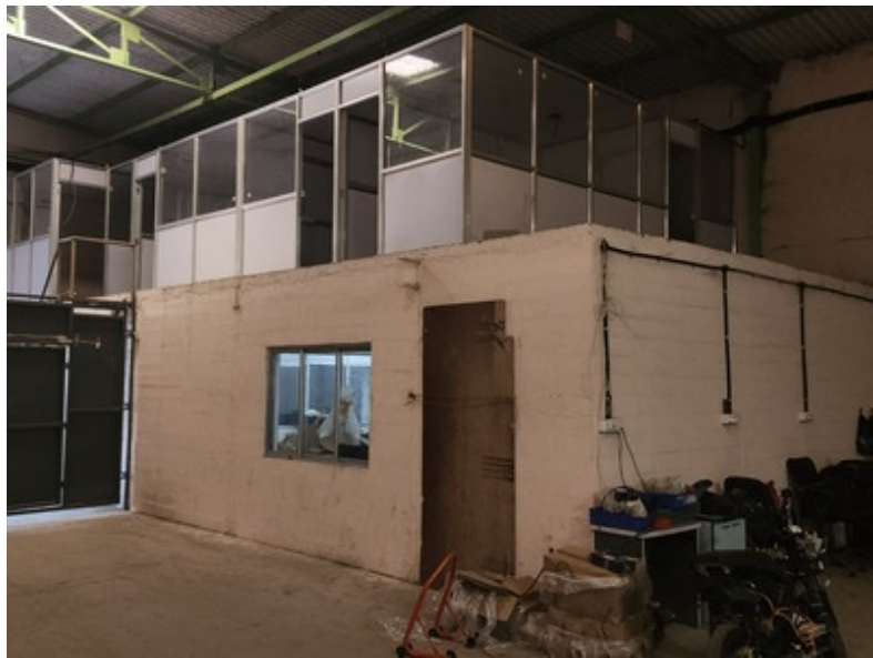
TEN CABINS GROUND PLUS ONE FLOOR