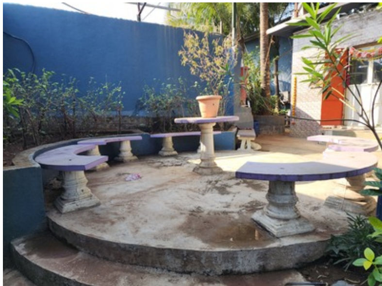
GARDEN SITTING AREA